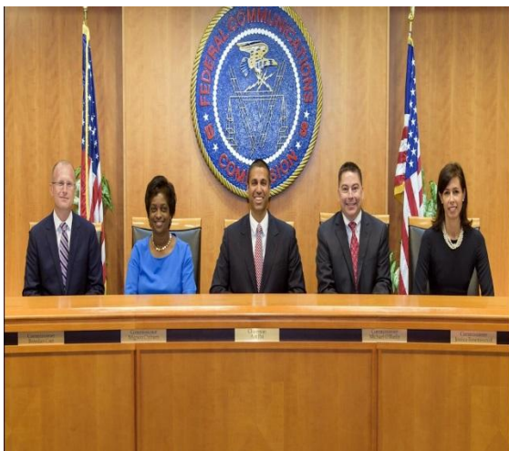
(Federal Communications Commission assembly)

forbidden for a network operator to make any distinction in the process of sources, destinations and contents. Until today net neutrality was protected and determined by the FCC (Federal Communications Commission). Created in 1934 by the US Congress, it is an independent agency responsible for regulating all the communications and content of radio, television and the Internet. Its delegates are directly chosen by the president.